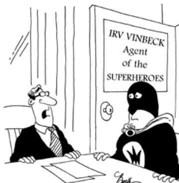
"Times are tough. The best I could do was license your image on kids' underwear."

No job should be "just a job." The connection between the leader and the individual is what makes it more than that.